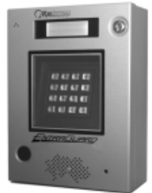
Entraguard Gold Telephone Entry Unit