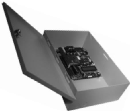
PXL-500 Tiger II Controller