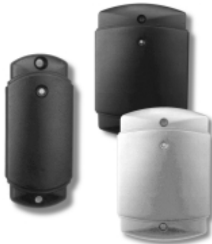
MS Series Proximity Readers