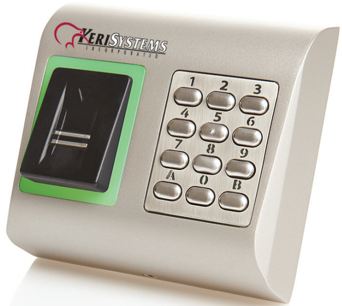
B100-SKP-SA Swipe-Fingerprint + PIN

Keri's B100-SKP-SA™ Readers provide reliable swipe- fingerprint reading in attractive and unobtrusive packages. Typically for small and medium installations, these readers can be used in residential areas, homes, offices, gate automations and other applications where high security is needed but simple installation is required.