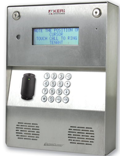
Image shows an EGS-WUPP with a Keri MS-3000 Prox Reader.

Also available as an EGS-WUPW, 26-Bit Wiegand with a P-300 Prox Reader.