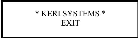
Figure 9: Exit Diagnostics Screen