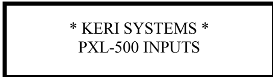
Figure 5: PXL-500/PXL-510 Inputs Test Entry Screen

NOTE: The Input Test Entry Screen only says PXL-500 even on a PXL-510 controller. This is normal.