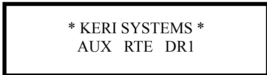
Figure 6: PXL-500/PXL-510 Inputs